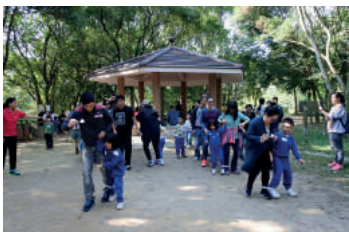
親子旅行活動遊戲真好玩！ It's fun to have games with our parents in the school picnic.

Two kindergartens Day Nurseries applied different funds to enrich students' life experiences and broaden their visions, including Home School Cooperation Committee's sponsorship on our parents' talks, workshops and reading programs; Leisure and Cultural Services Department's sponsorship on school green programs etc.