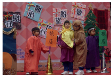
我們扮演主耶穌降生的聖經故事，與社區人士齊賀聖誕來臨！ We act the scene of Jesus birth from the bible and share the joy of Christmas with the community!

Two kindergartens Day Nurseries organized parents as schools volunteers for assisting story-telling programs, visits and school daily routines activities etc.