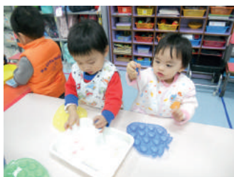
小水滴，滴下來！ A little drop of water is falling down!