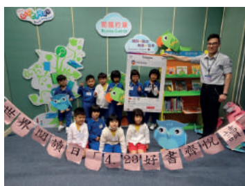
參觀公共圖書館，館長為我們介紹圖書！ We visit the public library and the librarian introduces the books to us!

Two kindergartens continued to organize talks and invited principal from primary school in the district to share with the parents on how to select primary school placement. Also, the schools organized the students and the parents to join the learning programs or visitation programs from local schools as well as launching a primary one mock activity at kindergarten so as to help students preparing themselves to adapt the life of primary school.