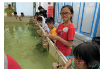
你們有興趣參與我們的「釣蝦之旅」嗎？ Do you want to join our Shrimp Fishing Trip?