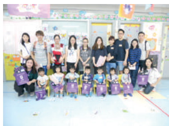
機構賣旗籌款，我們一定要支持！ We support SKHLMC's flag day!

Joyful Children World continued to launch different activities to encourage parental participation in promoting children's development such as parent-child reading program by learning story-telling to their children, home safety activity, parental education talks and health activities held under the cooperation with kindergarten.