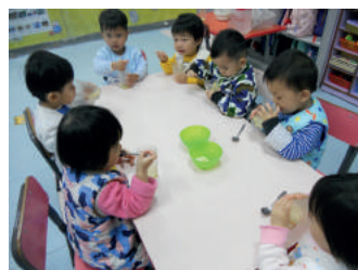
自己沖製的檸檬水特別好飲呀！ We make our delicious lemon tea!