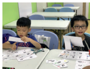
我們運用有趣的方法，以增強我們的記憶力。 We use interesting methods to enhance our memory.

We assisted parents to handle difficulties on child rearing and socioeconomic challenges by providing individual interview, counseling and family activities so that we could work together and provide positive guidance to children. Also, we provided fee-waving service to students with low-income family background so as to meet their social needs.