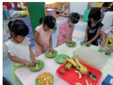
我哋識得自己造水果沙律呀！ We can make our fruit salad!

Two kindergartens Day Nurseries helped children and their families to have spiritual development through regular children worship session, gospel day camp, bible summer school, singing hymn of praise on Sunday worship etc.