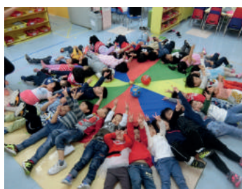
彩虹傘好好玩！ Parachute Fun game is very excited!