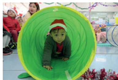
聖誕節又開心又有得玩！ It's fun to play at Christmas!

Two kindergartens Day Nurseries provided day care and education services for children aged 2 to 6 with comprehensive curriculum. Through theme approach and project approach, we assisted students to construct their knowledge, skills and attitudes during their learning.